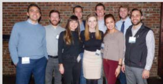
Our Young Professionals Advisory Council hosted their annual "Party with a Purpose" in Morristown. The Happy Hour helped provide holiday gifts for our shelter guests.

Wednesday, December 5 th our Young Professionals Advisory Council (YPAC) held their annual "Party with a Purpose" at The Laundromat in Morristown. We had a great showing and the group enjoyed networking while listening to our live guitarist. But, they had a purpose. They helped provide holiday gifts for our program guests by donating gift cards for local stores like Walmart and ShopRite.