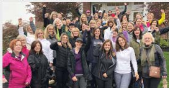
Women's Day attendees getting ready for a day of exercise and socializing while raising funds for homeless families.

Monday, October 15 th Hamilton Farm Golf Club was buzzing with activity and animated conversation as over 150 women from Morris and Somerset Counties gathered for our 11 th Annual Women's Day. They enjoyed a day of exercise and socializing while raising funds for homeless families. Morning activities were followed by mimosas and mingling, services from DePasquale the Spa, a ticket auction, and champagne pull. It was a great opportunity to network or meet up with friends for a good cause. The funds raised at Women's Day helped to provide childcare scholarships allowing the women in our programs to continue working while providing for their families.