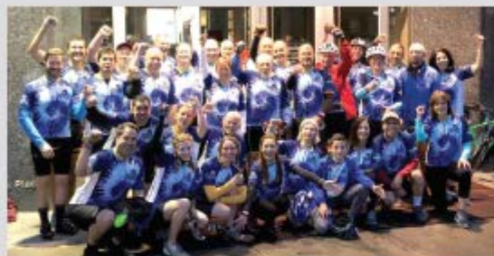
HSI Gran Fondo team took to the streets to help us build a better tomorrow. Funds raised from the cycling event are being used towards our newest housing project.

Like to ride? Join our team. It's a great way to do something you enjoy while making an impact in the community. Oh, and we have the best jerseys too!